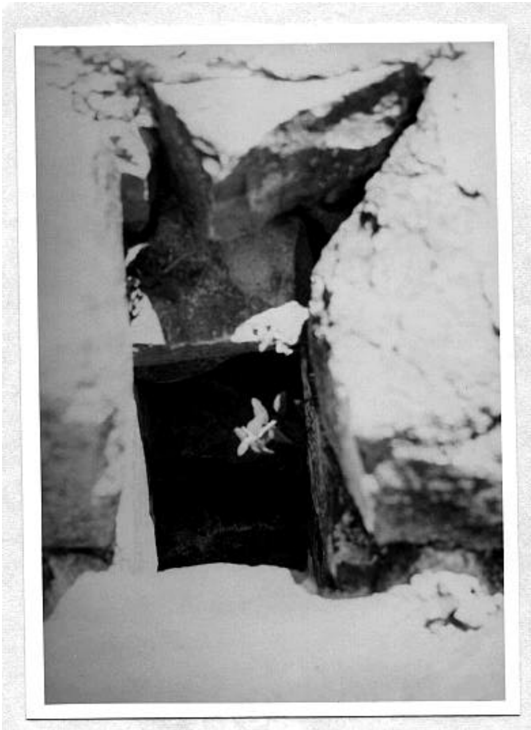
Figure 3. The intersection of the inclined tube with the zenith tube is marked by the carefully cut and fitted stones just behind (below) the small plant in the middle of the picture.